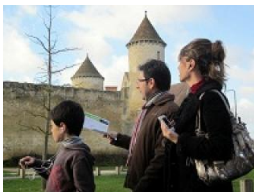
Downloadable audio guided visits

A personalised visit of the castle at your own rhythm.