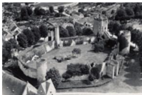
Ruins of the castle of Blandy