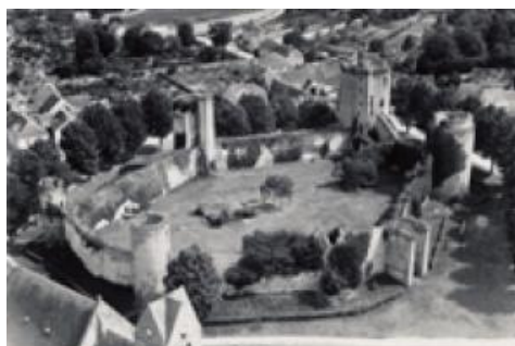
Ruins of the castle of Blandy