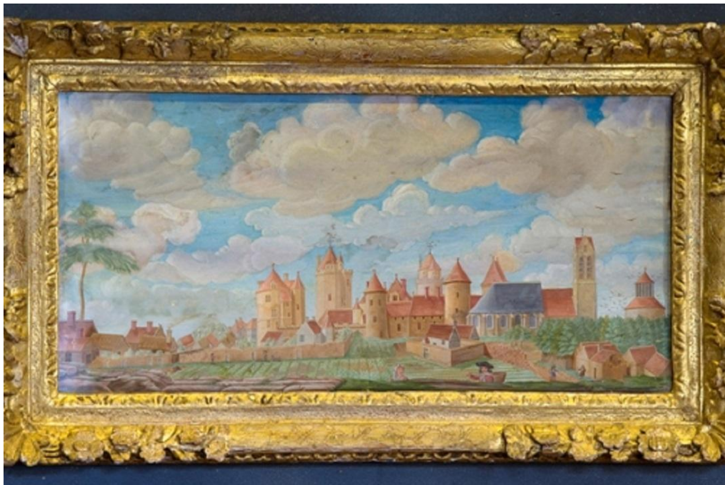
View of the castle of Blandy, Mid XVIIth century, gouache on paper stuck on a wooden panel (property of the municipality of Blandy-les-Tours)

ne tower. The 6th level is the parapet walk, encircled by machicolations. The watch tower (with a parapet walk) and the archival tower (with a latrine turret) are a little less high. According to the desire of the Counts of Tancaurville, Blandy becomes a place of defence as well as a residence at the threshold of the Hundred Years' War.