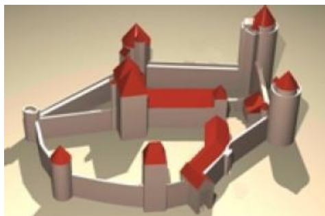
The fortified castle in the 14th century

As from 1316, the Viscounts of Melun form an alliance with the Counts of Tancarville. New structural changes followed by several construction campaigns during the 14th century transform the old stronghold into the fortified castle we know today.