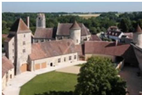
North part of the castle's enclosure

The Viscounts of Melun built a fortified manor in Blandy which goes back possibly to the 11th century. In 1016, the earldom of Melun was incorporated in the royal domain. Such a stronghold was therefore the expression of royal power and held a strategic position in order to watch over the shared border with the impetuous Count of Champagne.