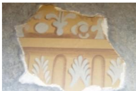
Painted coating, XVIth century, painting on plaster Place of discovery : seigneurial dwelling

For two and a half centuries after the Hundred Years' War, the castle belongs to the most illustrious families of the kingdom : its owners are allied to the Orléans-Longueville, the Bourbons-Soissons, the Savoie and the Nemours families.