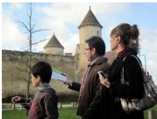
Downloadable audio guided visits

A personalised visit of the castle at your own rhythm.