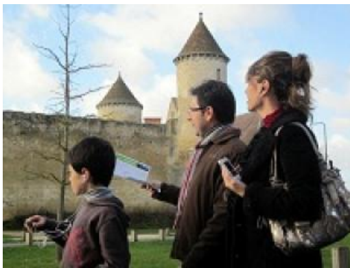
Downloadable audio guided visits

A personalised visit of the castle at your own rhythm.